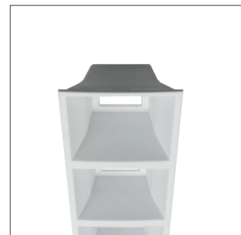
WM lens shade