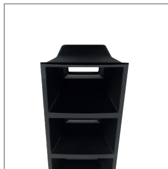
BM lens shade